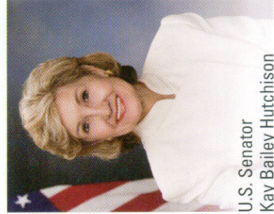
U.S. Senator Kay Bailey Hutchison

digital broadcasts into analog format for display on older television sets. Newer televisions equipped with digital tuners will be able to receive the new digital broadcast signal and may not require the use of a converter box.